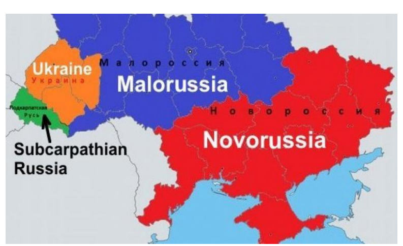
\label{linear_figure} \begin{tabular}{ll} Figure 6: Map at $$ $\underline{https://www.geopolitica.ru/en/article/there-are-no-valid-arguments-against-liberation-novorossia} (Accessed 5 Feb. 2018) \end{tabular}

On other maps similar to the one in Figure 6, Ukraine is reduced to a minimum in the far west of the contemporary state (<a href="https://www.geopolitica.ru">https://www.geopolitica.ru</a> site, subtitled with the slogan "Carthago delanda est").