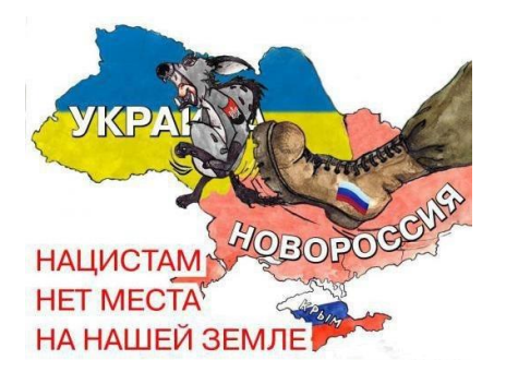
Figure 10: Map at <a href="http://www.e-news.su/in-ukraine/45935-za-chto-voyuet-donbass.html">http://www.e-news.su/in-ukraine/45935-za-chto-voyuet-donbass.html</a> (Accessed 5 Feb. 2018)

In Figure 10, the thesis of the non-existence of a real Ukraine in its contemporary borders is openly combined with the segregation of good and evil and the condemnation of Ukrainians as fascists or supporters of fascism. The indication that the boot is a Russian one demonstrates that the war in Donbass is not only a civil war, but rather a Russian-Ukrainian war.