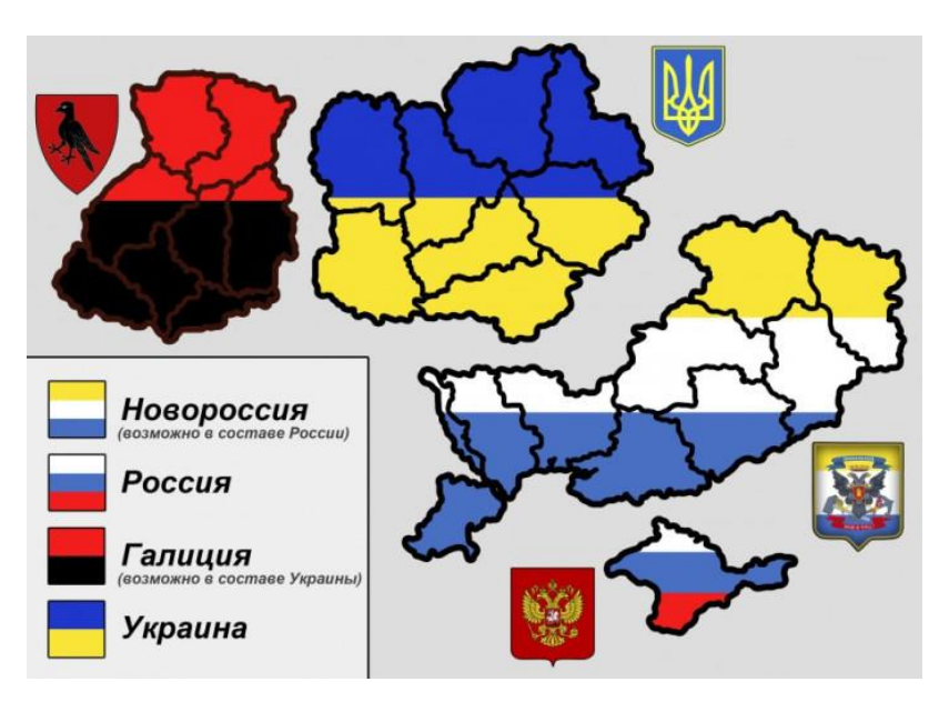
Figure 7: Map at <a href="https://arcktick.livejournal.com/15240.html">https://arcktick.livejournal.com/15240.html</a> (Accessed 21 Mar. 2018)

Another hostile example of political fragmentation in which Ukraine looks wider than it does in Figure 6, but is nevertheless separated from Novorossiia, is a map found on <a href="http://LiveJournal.com">http://LiveJournal.com</a> (Figure 7). It was placed on the website by a user with the nickname arcktick on March 15, 2014.