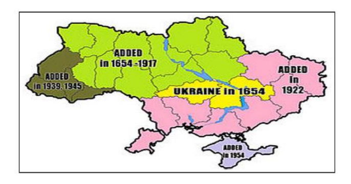
Figure 5: Map at <a href="http://stanislavs.org/category/ukraine-russia/page/2/">http://stanislavs.org/category/ukraine-russia/page/2/</a> (Accessed 22 Mar. 2018)

Nothing is easier to visualize than the fragmentation of a country. Especially in popular geopolitics, a map provides a simplified view of political geography in which an alternative political "reality" seems to be real (cf. Uffelmann; Dodds). The map expresses a thesis about what is the case, or what should be the case. On sites with anti-Ukrainian positions, numerous fictive maps circulate, on which Ukraine is reduced to a small territory or has even completely vanished. One thesis behind those maps is expressed in an English post on the site <a href="http://stanislavs.org">http://stanislavs.org</a> (from Feb. 27, 2016). This post is titled "How Malorossiia Was Turned into the Patch-quilt of Discord That Is 'Ukraine.'" On the map illustrated in Figure 5, Ukraine is reduced to the territory of the Zaporozhian Cossacks in the middle of the seventeenth century. All other territories are indicated as being "added" in several periods, the last being "added" in 1954.