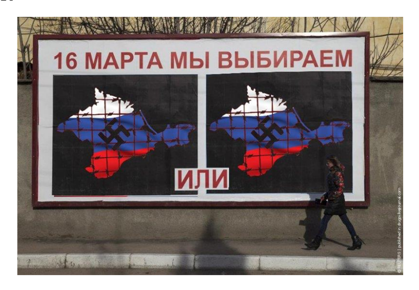
Figure 3: Manipulated election poster for the Crimean referendum (March 16, 2014^3

published in 2014. In this particular figure, both maps of Crimea are in Russian colours and covered by swastika and barbed wire (Figure 3).