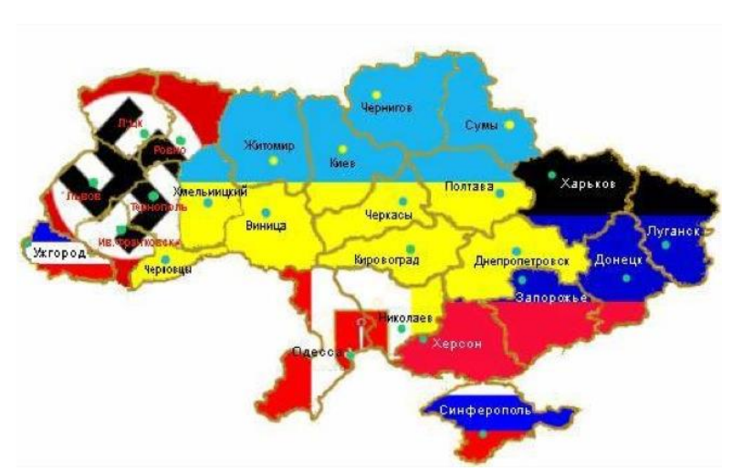
Figure 9: Map at <a href="http://stanislavs.org/category/ukraine-russia/page/2/">http://stanislavs.org/category/ukraine-russia/page/2/</a> (Accessed 22 Mar. 2018)

The colouring of different parts of a map can be even more defamatory. On a map from the website <a href="http://stanislavs.org">http://stanislavs.org</a> in Figure 9, Galicia is covered by the Nazi flag with the swastika.