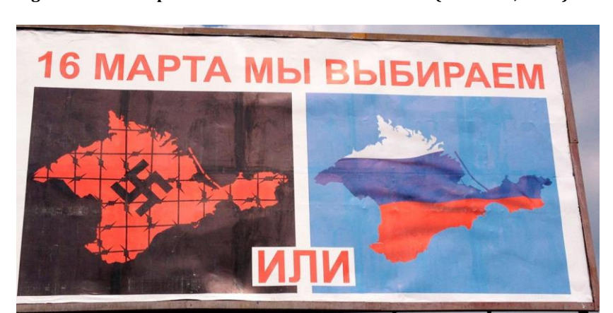
Figure 2: Election poster for the Crimean referendum (March 16, 2014)<sup>2</sup>

Before the Crimean referendum (March 16, 2014), an election poster outed the illegal and aggressive character of the annexation, as seen in Figure 2. It showed two maps of Crimea: on the left side the peninsula is coloured deeply red with a swastika on it covered by barbed wire. On the right-side Crimea has the colours of the Russian flag. The header of the poster contained the phrase "On March 16 we will choose either ... or," while the alternative conjunction or (Russ. ili), positioned at the bottom between the two pictures of Crimea, signifies "occupied by fascists" or "liberated by Russia."