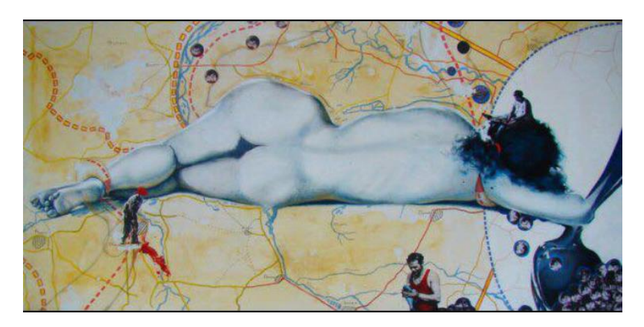
Figure 10. Christina Katrakis. Caviar - The Map of Eastern Promises. 2010. 3x6.5'(92 x199cm) mixed media on wood. Courtesy of Christina Katrakis.

Expressing traumas or traumatic memories associated with a certain place and experience is never an easy task. Producing a meaningful conversation using visual means is an even harder mission. Trauma-related art works are not usually created in a condition of post-traumatic distress but emerge as an intellectual and, therefore, a creative attempt to overcome trauma and conduct a dialogue with yourself and your contemporaries about lived traumatic experiences. Trauma is like the Beast in Katrakis's painting: it is invisible, schematic, often incomprehensible, and sometimes can be expressed only with the use of archaic symbols and ideas in order to produce a metaphor of suffering.