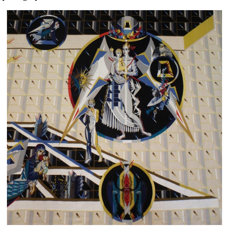
Figure 1a. Aliaksandr Kishchanka, Detail of Chernobyl , 1991. Tapestry. Wool threads, 32'9'' \times 13'2'' . United Nations Headquarters, New York.

This epic tapestry tells the story of the disaster in metaphorical images. Referencing Renaissance art, folk art, Greek mythology, and William Blake's illustrations to Milton's Paradise Lost , Kishchanka unfolds his allusion-laden narrative in three parts. The centre of the composition is a human, worshipping the sign of atomic energy, which spurts with dragons, epitomizing the disaster. The rooster represents a warning and refers to Slavic folklore. A symbol of self-assurance, the human figure resembles both the Blakeian fallen angel and the Greek Icarus—his wings are false and attached with strings. Below him is St. George killing the dragon, an image that symbolizes firefighters and those who contained the disaster. The same human on the left is holding a book with the image of Golgotha which forecasts future suffering.