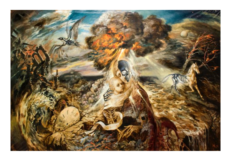
Figure 5. Ivan Zhupan, Chornobyl's'ka madonna ("Apokalipsys") (Chornobyl Madonna ["Apocalypse"]), 1996. 60 \times 70 cm. The National Museum "Chornobyl," Kyiv. Courtesy of the National Museum "Chornobyl." The image was provided by Anna Korolevs'ka.

Figure 4. Iurii Nikitin, Vzryv ( Explosion ), 1998, 99 × 149 cv. Oil on canvas. The National Museum "Chornobyl," Kyiv. Courtesy of the National Museum "Chornobyl." The image was provided by Anna Korolevs'ka.