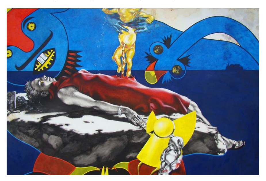
Figure 9. Christina Katrakis, The Omen , from the series The Zone , 2010. Mixed technique. 6 X 4' (183 X 122 cm). Courtesy of Christina Katrakis.

The canvas combines two painting modes. The surrealist and completely flat Beast is a schematic, symbolic, and imaginary creature that contrasts with a realistically-depicted with careful chiaroscuro, woman in a red dress (a symbol of blood) who lies on a bed of a grey rock. Referring to Henry Fuseli's Nightmare (1781), the dreaming woman seems calm and undisturbed. But the golden baby with an umbilical cord that stretches from her eviscerated womb appears directly at the centre of the composition and creates a message of personal, not generalized, tragedy. Another Katrakis's work, Caviar - The Map of Eastern Promises (2010), also refers to women and their infertilities caused by Chornobyl and reverberates with Mishchenko's I Want to Live. It portrays the body of a nude woman shaped as the Sea of Kyiv (the water reservoir), which was damaged by Chornobyl catastrophe.<sup>19</sup> As Katrakis describes, "The area around it is a map of the Zone, with the soviet collage of caviar factory workers. Yet caviar produced by them is in the shape of embryos, since the explosion damaged female reproduction function and brought upon born-defects in babies" ("Caviar"). The nude female body is perfectly beautiful and resembles a sleeping Venus (with an allusion to Diego Velasquez's Rokeby Venus, painted between 1647 and