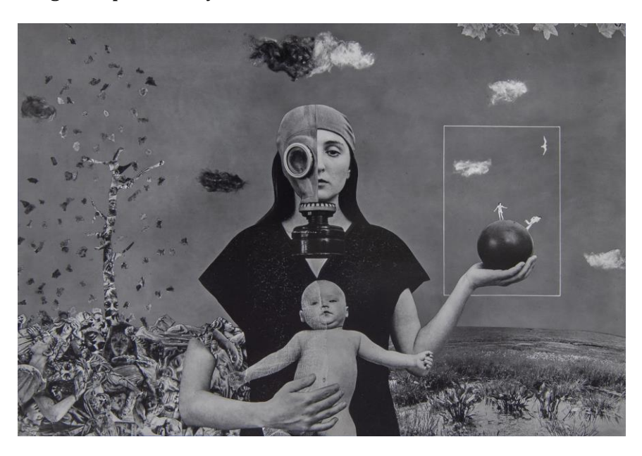
Figure 6. Ievhenii Pavlov, Al'ternatyva ( The Alternative ), 1985. Photomontage. Gelatin silver print.

The association of trauma with the maternal was exploited by artists long before the Chornobyl disaster, and such images of motherhood were often related to the trauma of war. Moreover, this trope was already employed by Pavlov's contemporary Savitski in his already mentioned Madonna Birkenau (1978), Partyzanskaia madona ( The Partisan Madonna , 1967) and Partyzanskaia madona , Minskaia ( The Partisan Madonna of Minsk , 1978). When reflecting on anticipation of the disaster, Pavlov as well as other artists extracted from his memory those cultural archetypes that were traditionally associated with the idea of primordial female fertility and