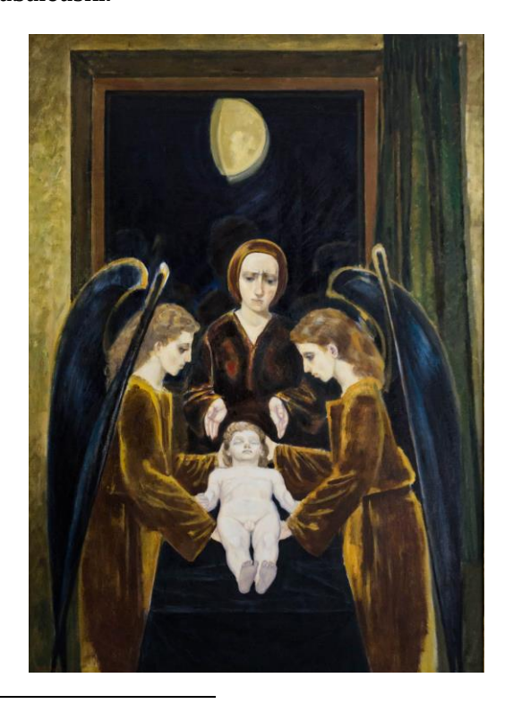
Figure 2. Mikhail Savitski, Charnobyl'skaia madona (The Madonna of Charnobyl), from the series Black Truth (Chornaia byl'), 1989. Oil on canvas.

her sides. In Savitski's interpretation, the child is dead and the scene of celebration and glory is transformed into a scene of mourning, becoming a pietà (a representation of the dead Christ, attended by the Virgin Mary).<sup>11</sup>